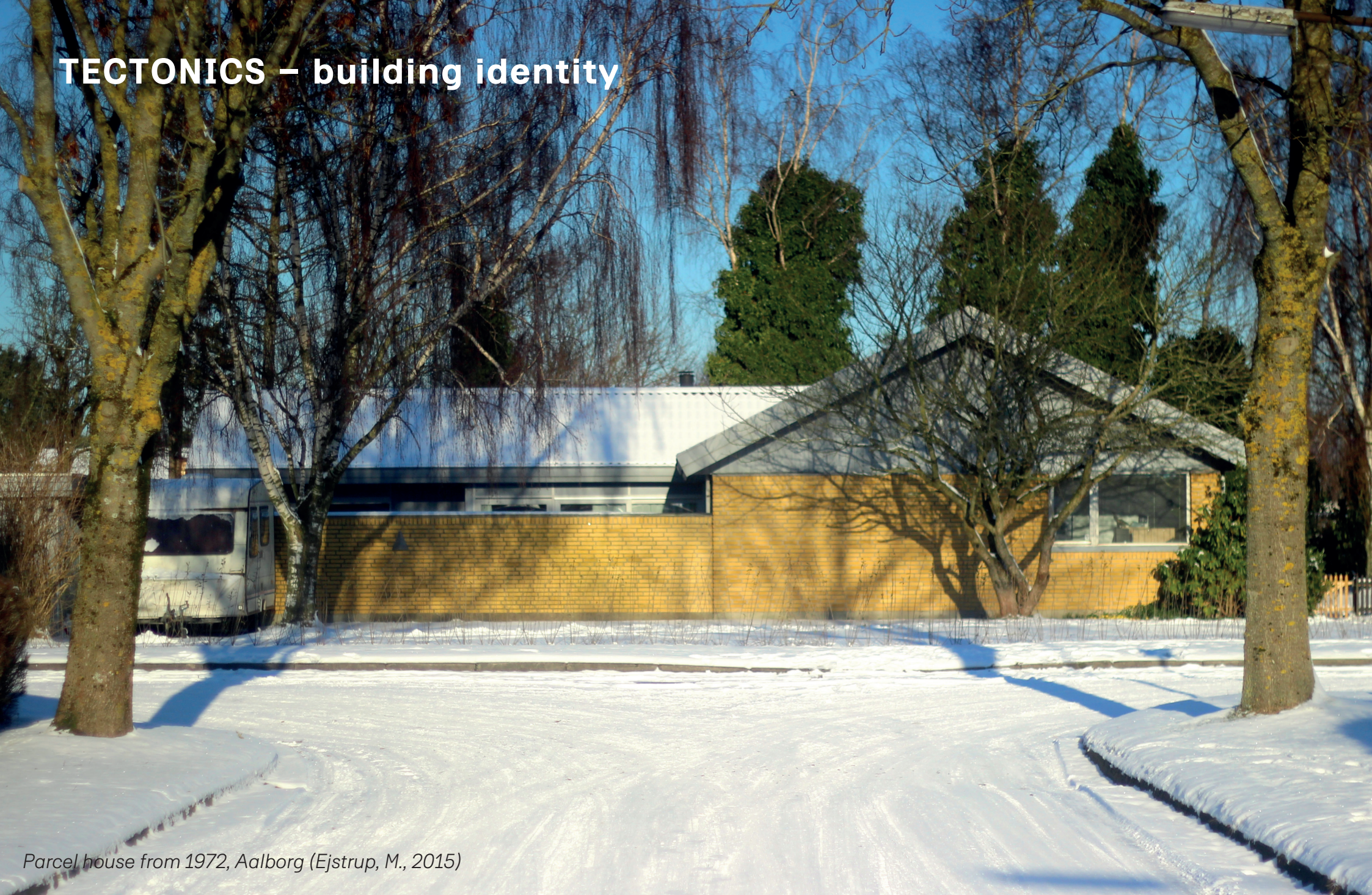
Parcel house from 1972, Aalborg