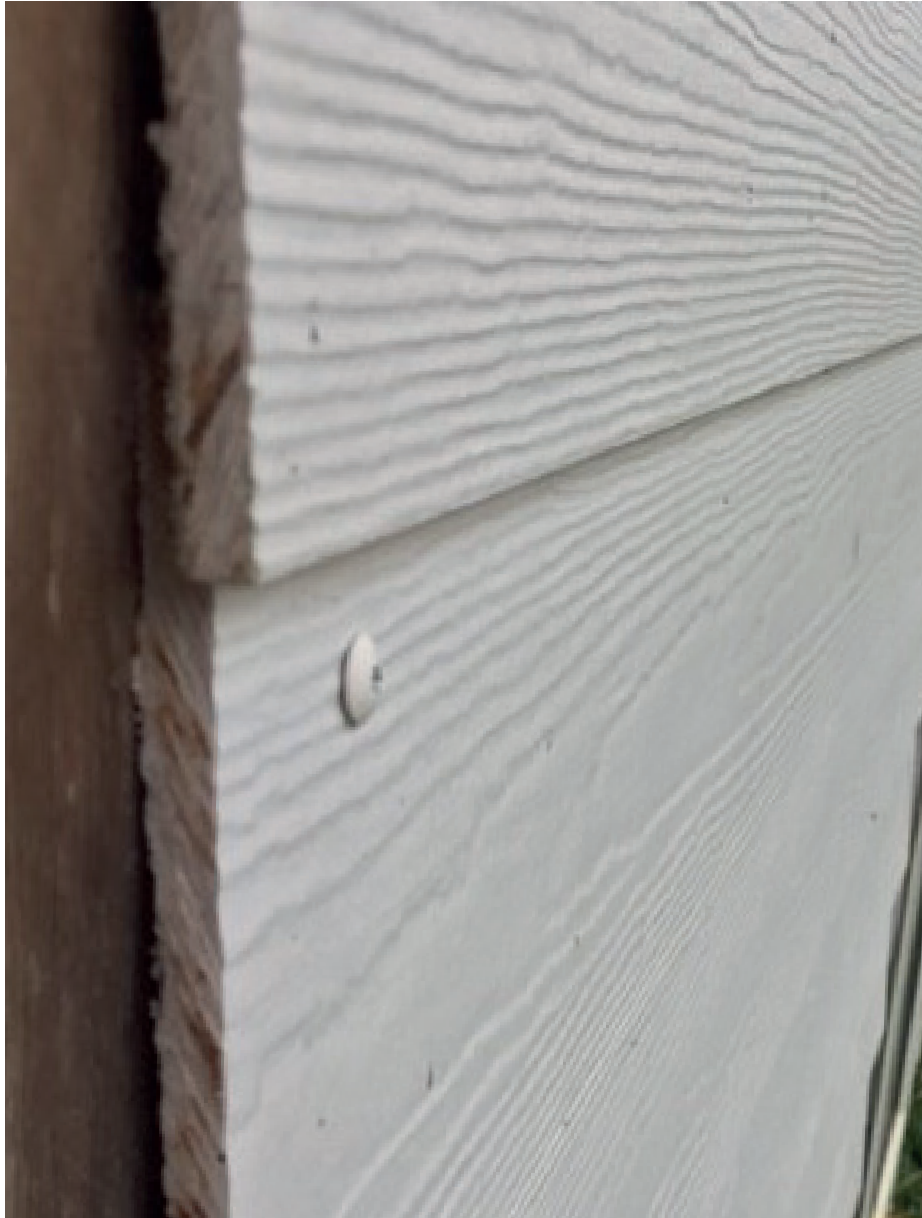
Boards of fiber cement imitating wood structure, (Ejstrup, H., 2022)