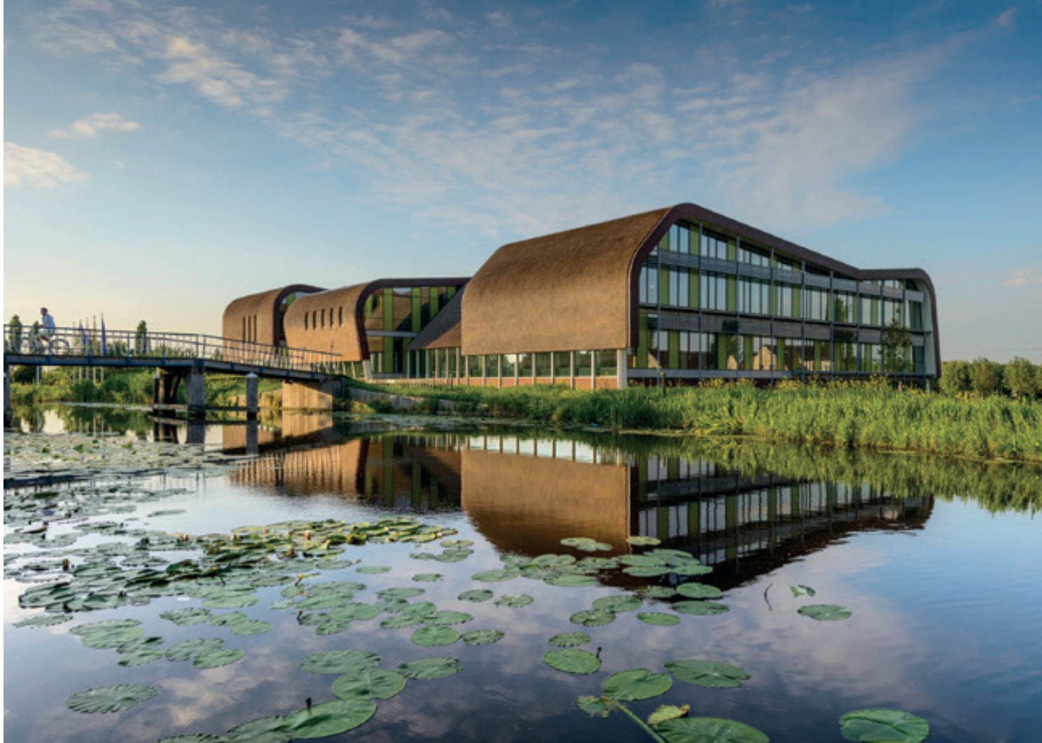
Inbo Architects, Midden-Delfland Town Hall, 2012, (TimerIq, september 2013)